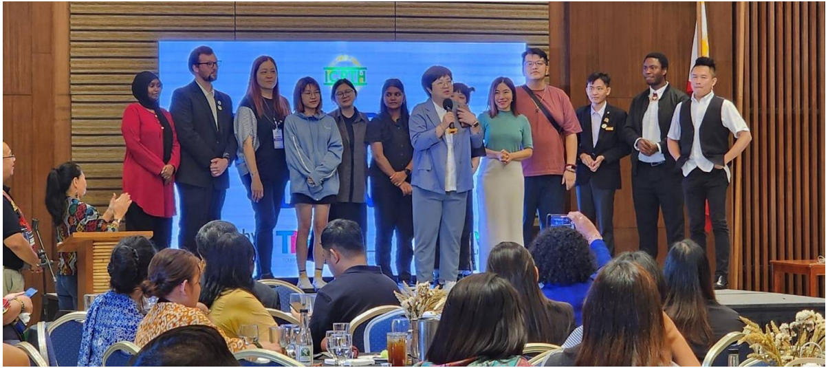
Closing and Award Ceremony