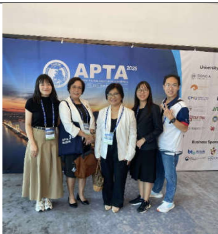
Connecting with fellow delegates (July 7)