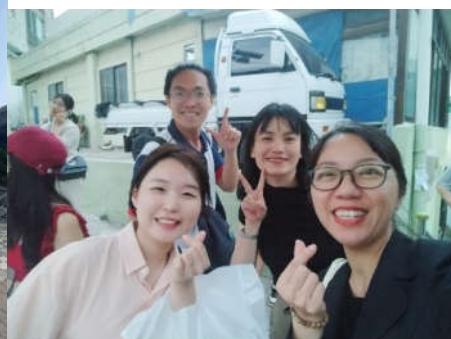
Experiencing Busan with international friends (July 10)