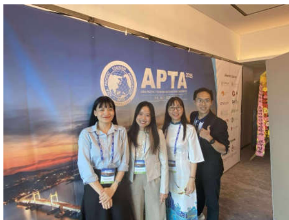
Connecting with fellow delegates (July 8)