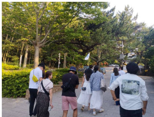
Visiting Taejongdae in Yeongdo District with fellow delegates (July 8)