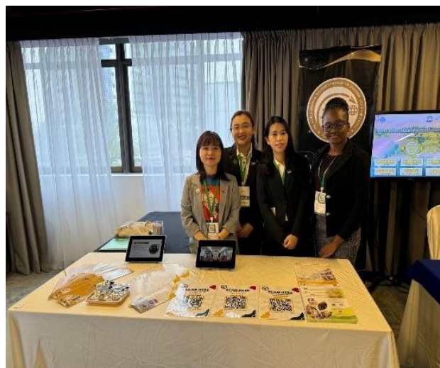
IMTH Classmates at our booth in the exhibition area