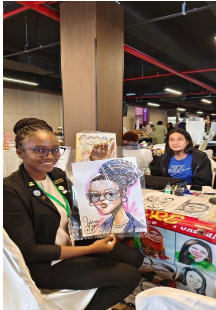
Patronizing a local artist