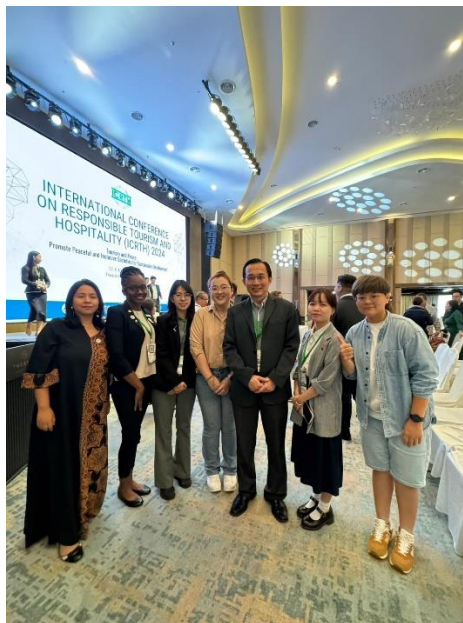
Prizegiving and Closing Ceremony