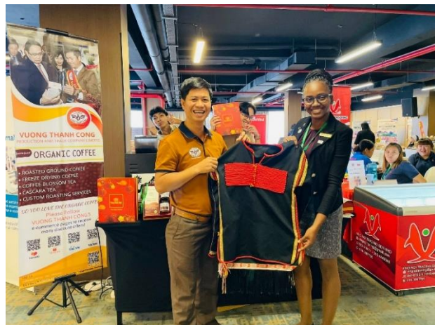
Networking with Industry Professionals and learning about their product and service offerings