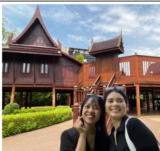
Experiencing in Bangkok & Chiang Mai with international friends