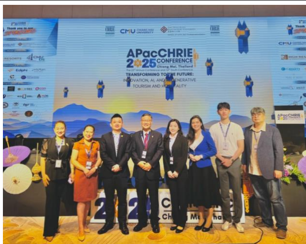
Connecting with fellow conference delegates (May 29)