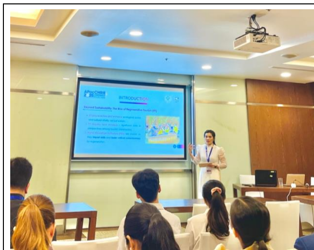
Presenting in the “Transformation in Education” session in the Conference (May 28)