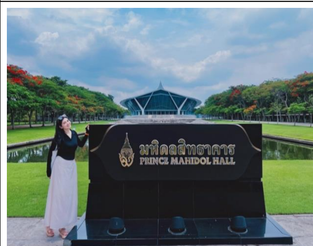
Visiting Mahidol University in Bangkok (May 24)