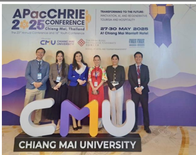
Networking at the conference venue with the APacCHRIE 2025 backdrop