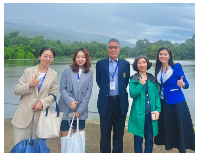
Visiting Chiang Mai University with delegates from HK PolyU and APU (Asia Pacific University)