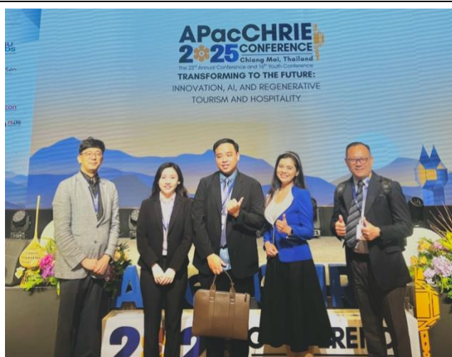
Gathering with the NKUHT team at the APacCHRIE 2025