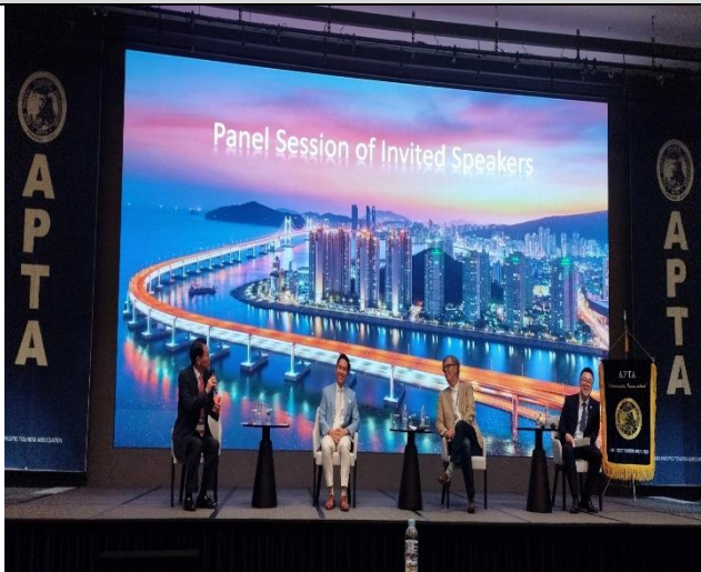
Connecting with fellow conference delegates from Dong A University