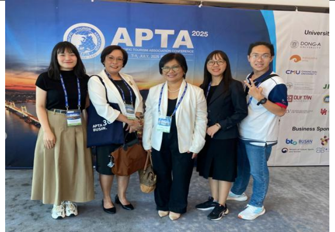
Captured a photo with the moderator, commentator, and fellow presenters