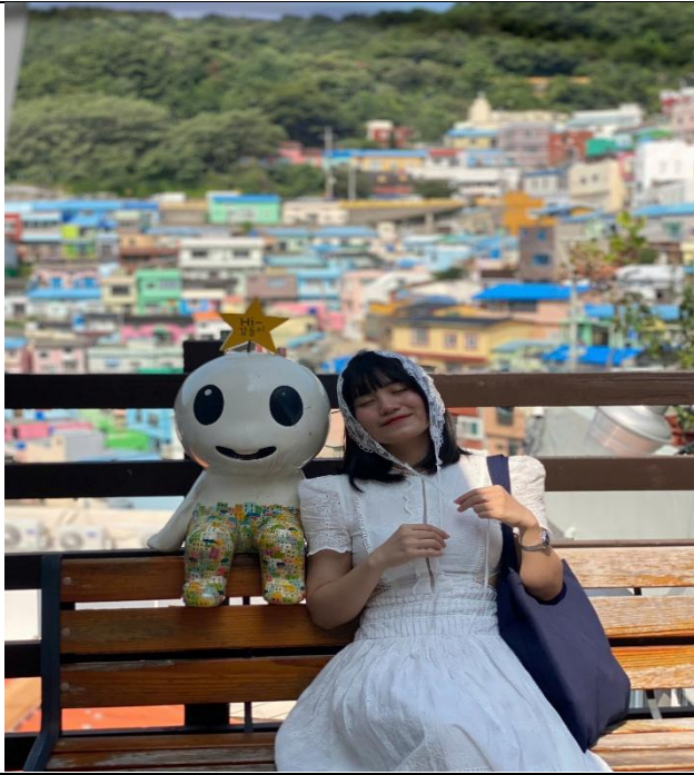
Experiencing in Busan with international friends