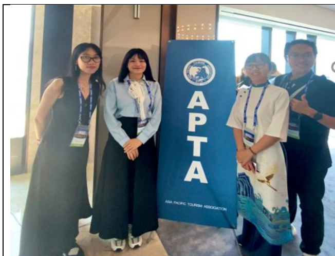
Connecting with fellow conference delegates from NKUST