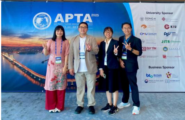
Presenting the Tip - session in the Conference (July 7th)